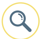
Image Manager has been designed from the ground up to simplify browsing & filtering image files. Numerous features greatly aid in the user's productivity.